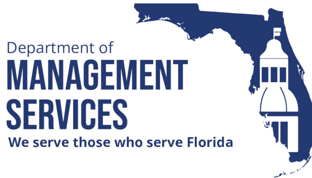
Exhibit B ENTERPRISE STANDARD TERMS AND CONDITIONS

These Enterprise Standard Terms and Conditions set forth the terms and conditions regarding the administration of the Term Contract, including the provision of Products to Customers. Customer specific terms for purchases off this Term Contract shall be set forth in the Customer specific agreement.